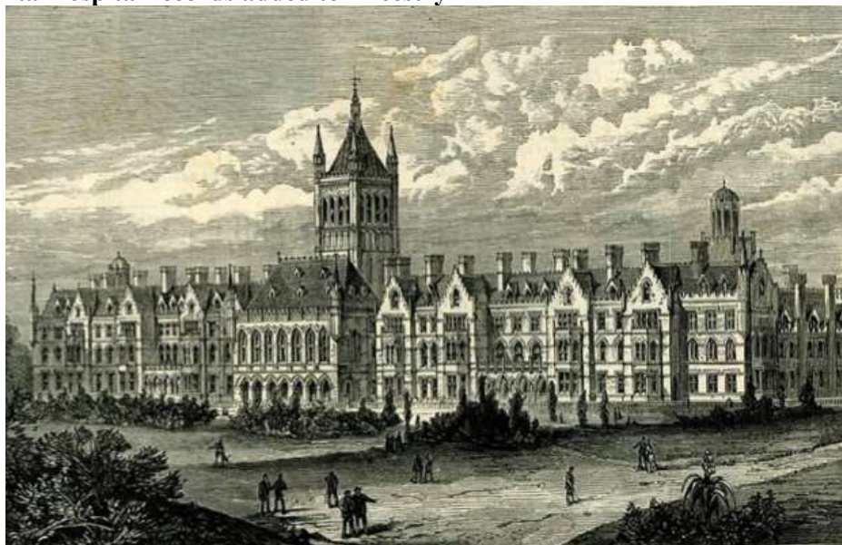
An engraving of Holloway Sanatorium from the Illustrated London News , 1884

Over 11,000 historic mental hospital records have been published online for the first time.