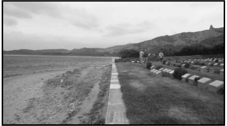
The Aegean Sea on the left, that “pissy” piece of beach and Ari Burni cemetery on the right. The Sphinx is the jutting knob in the background on the far right.

Ari Burni, on the far point of Anzac Cove, is where the first 16,000 Australians landed and by days' end 2,000 of ours were dead. And by days' end a reinforced Turkish army had also lost 2,000 young lives. This is our first stop and our first cemetery and also where the famous quote by Ataturk is strategically placed. It is a very small cemetery and obviously not