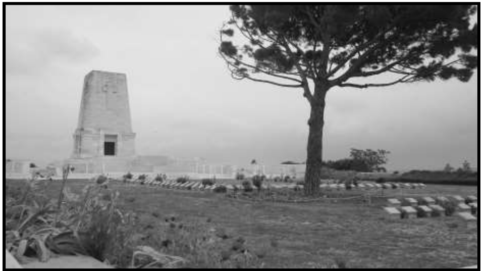
Lone Pine cemetery, perched high on the ridge.

We make our way back to the bus and the mood is definitely sober. It is just up the road that we stop off at a Turkish monument of