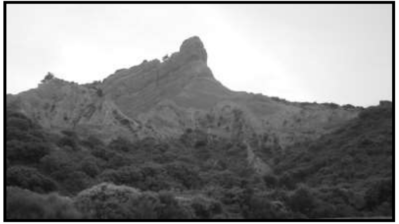
The Sphinx, dominates the horizon at the commemoration site.

die .... they'd find another way. I know that is simplistic. But I can't abide this horrendous loss of young lives.