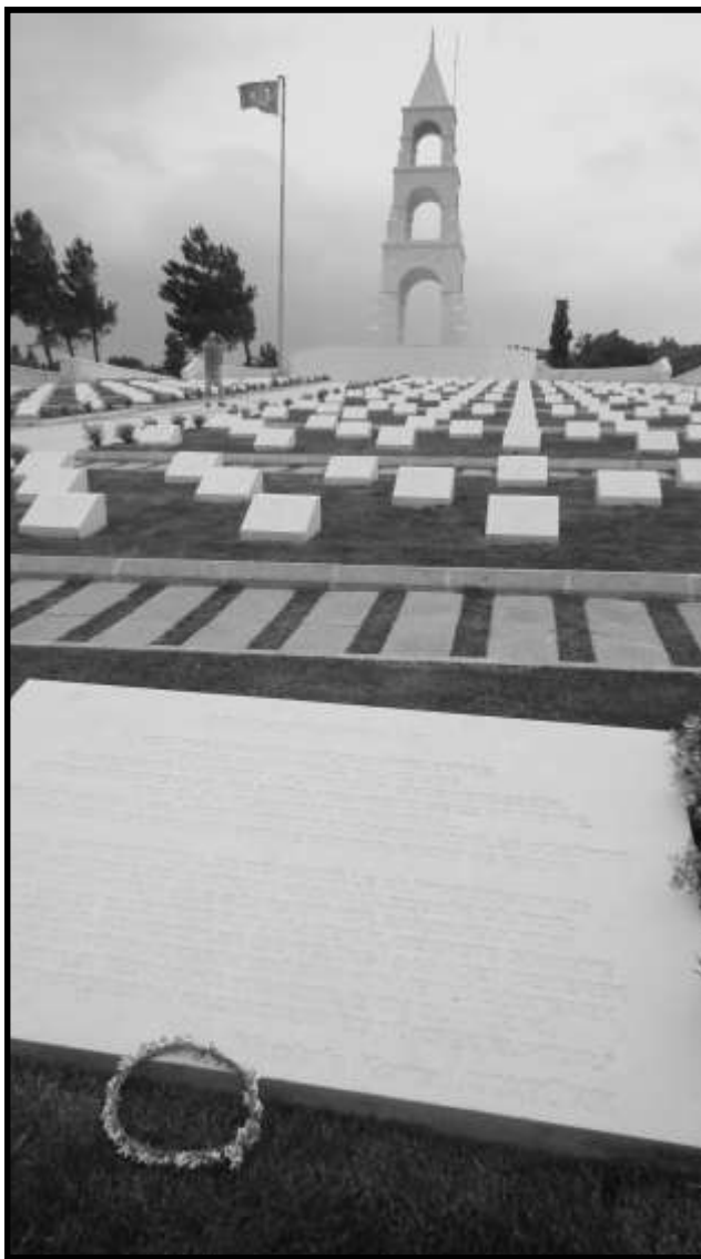
My garland of daisies at the 57th Regiment Alay cemetery, the main Turkish cemetery.