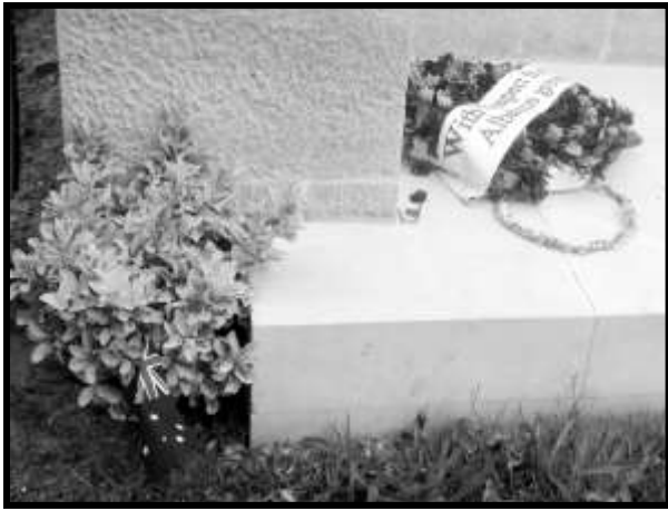
One of our garlands (front right) at Ari Burni cemetery.