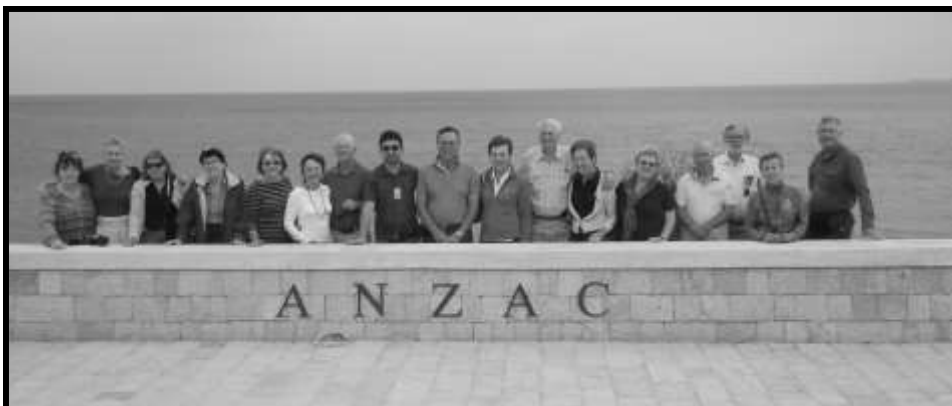
All of us at the commemoration site.